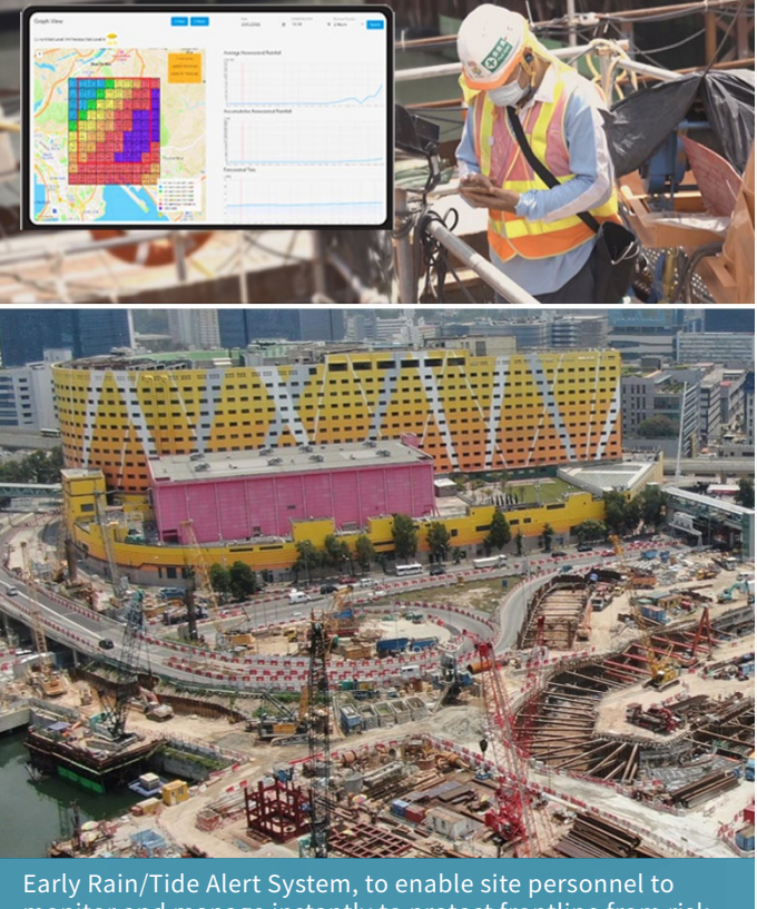
Early Rain/Tide Alert System, to enable site personnel to monitor and manage instantly to protect frontline from risk of safety