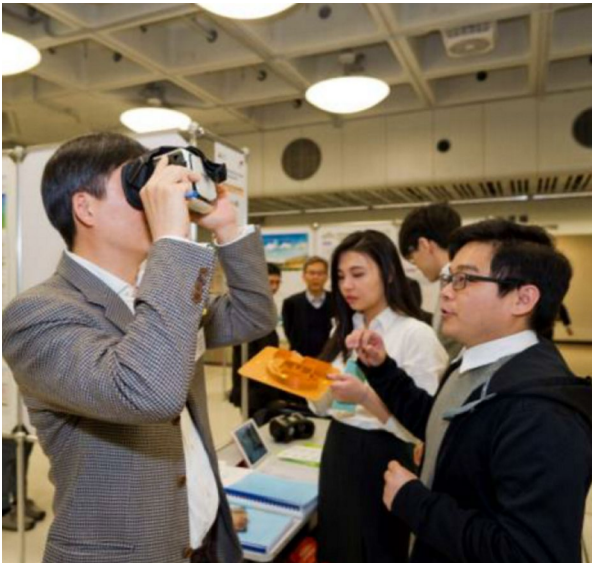
Students Presenting their project using Virtual Reality in the Integrated Building Project Development Exhibition and Competition