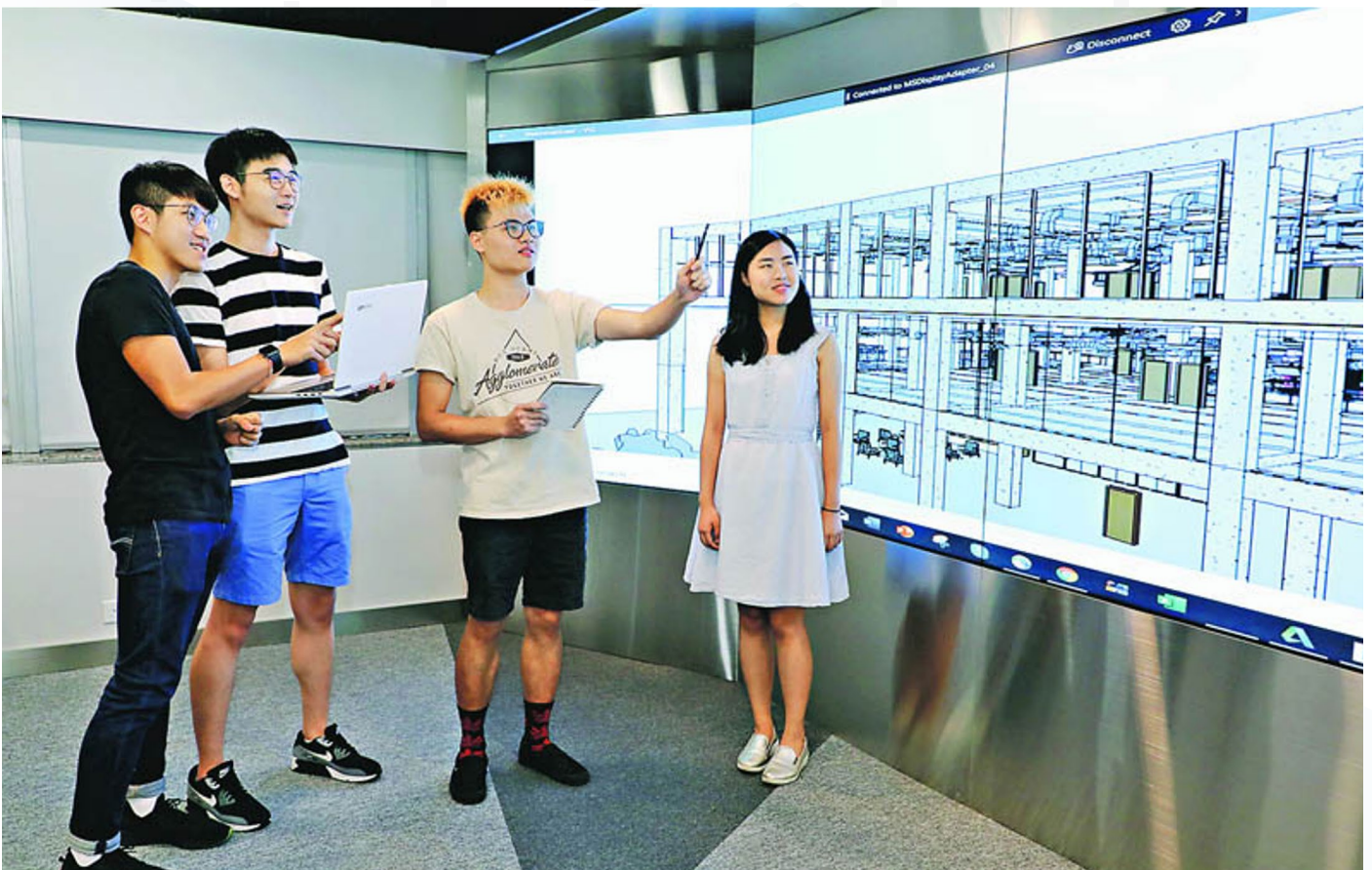
Students learn and use BIM in the Built Informatics and Smart Cities Cluster (BISCC)